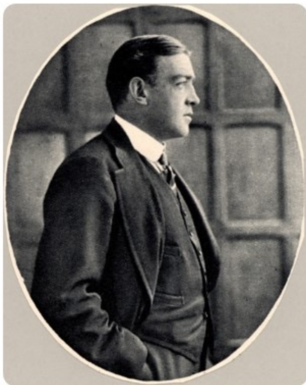
Pictured: Portrait of Sir Ernest Henry Shackleton

Ernest Henry Shackleton was born on 15 th February 1874 in Ireland. His father was a doctor and wanted his son to be one too, but Shackleton decided to join the merchant navy at the age of 16 instead. He was a keen explorer and was very interested in the North and South poles.