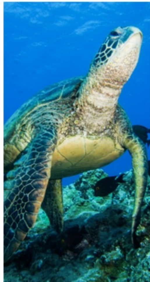
Pictured: A green sea turtle.

A breeding ground for green sea turtles has reported a 500 percent boom in the number of eggs laid since hunting them was banned. Scientists at Aldabra Atoll, one of Seychelles' most distant islands (it is over 1,000km southwest of the main island of Mahé), say this is a great conservation success story. An atoll is a coral island consisting of a reef surrounding a lagoon, generally over a former oceanic volcano. The endangered reptiles are one of the world's largest species of turtle, weighing up to 130kg and measuring up to 1.2m. They are great swimmers, who eat marine plants such as seaweed and sea grass, and they can live for up to 80 years! Professor Brendan Godley, from Exeter University, who helped to analyse the figures provided by researchers from the Seychelles Islands Foundation said, "The ongoing population increase of Aldabra's green turtles is testament to long-term protection and offers some clear evidence of the fact that we can be optimistic about marine conservation, well enacted."