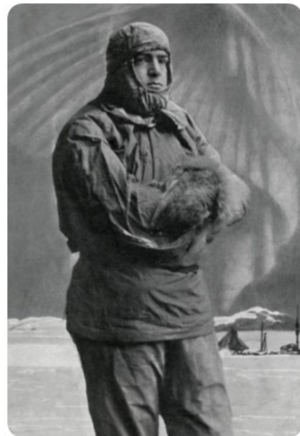
Pictured: Sir Ernest Henry Shackleton, who led three British expeditions to Antarctica.

Shackleton died on his fourth expedition to the Antarctic on 5 th January 1922.