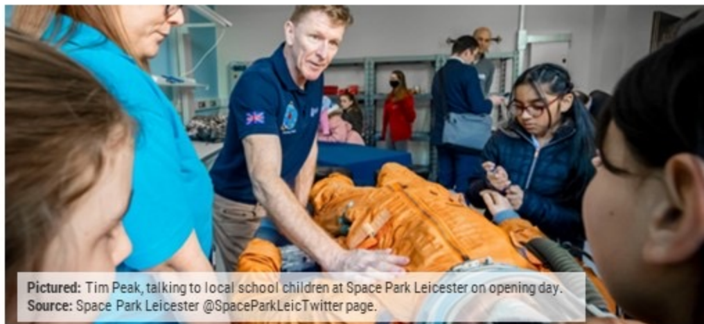
Pictured: Tim Peak, talking to local school children at Space Park Leicester on opening day.

joined in with a celebration of Mars Day. Tim said, "Every successful space mission calls for experts from a wide range of backgrounds to pull together and collaborate to answer bigger questions: and that's exactly what somewhere like Space Park Leicester helps to provide. I'm also excited to see this project highlighting the exciting careers available within the space sector and helping to train, educate and inspire our future generations."