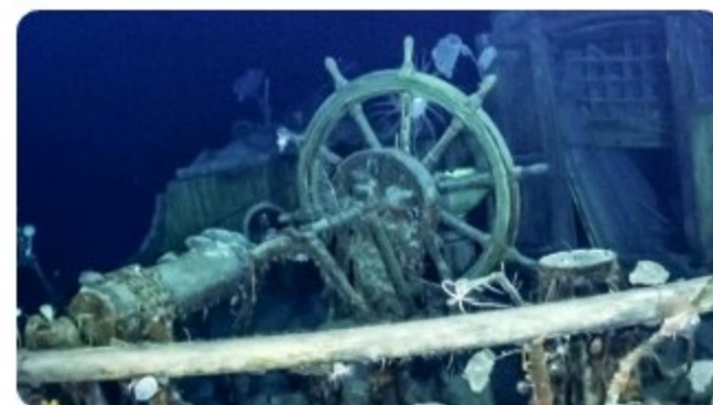
Pictured above: A photo of the discovered ship's wheel, found in the well deck.

On March 9 th , 2022, a team of scientists and adventurers announced they had finally located what remained of Endurance at the bottom of Antarctica's Weddell Sea. The team made the discovery using underwater robots, drones and by taking photos of the long-lost wooden ship where it had lodged in the seabed nearly 10,000 feet (over 3,000 metres) deep in clear and icy waters.