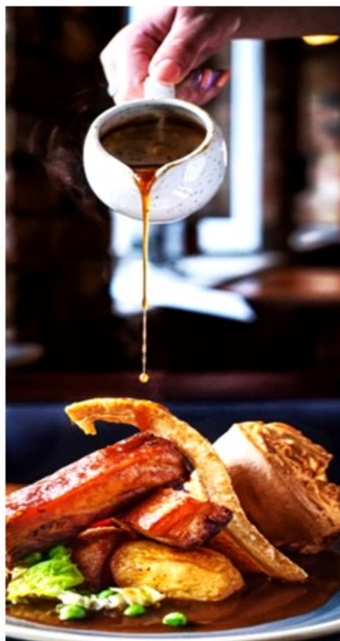
Pictured: Sunday roast dinner.