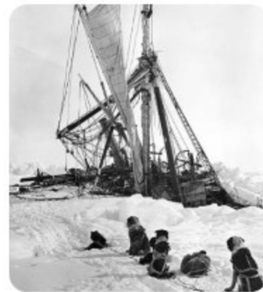
Pictured above: Endurance crushed by the ice and the expedition's dogs

Frank Hurley was the Endurance expedition's official photographer. He captured these images.