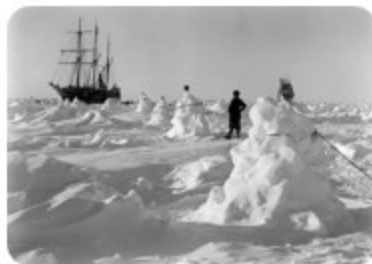
Pictured above: Endurance trapped in the ice. The crew set up mounds of ice with rope tied between each so they knew where they were in darkness and blizzards.

The rough seas surrounding Elephant Island made rescue of the other Endurance crew members difficult, but Shackleton refused to give up. They were reached in August 1916. Shackleton's Antarctic mission had, by all accounts, failed but success and glory came with every single crew member being kept safe, alive and finally rescued.